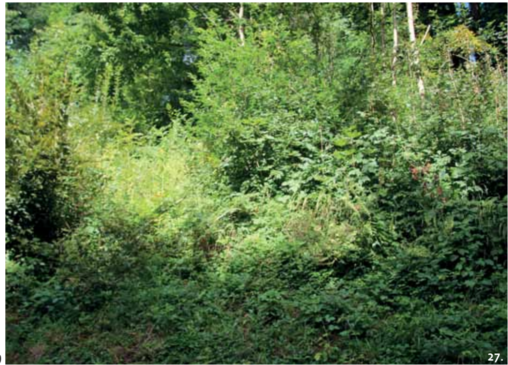
27.) Gozdni rob./A forest edge.