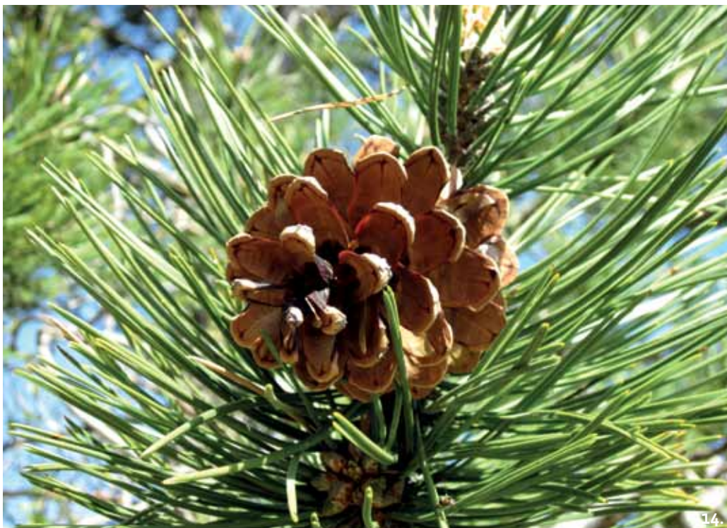
14.) Črni bor/Black pine ( Pinus nigra ).

The Castle Hill is a mixture of native forest, which is dominated by oak trees ( Quercus petraea , Q. robur ), hornbeam ( Carpinus betulus ) with sycamore maple tree ( Acer pseudoplatanus ), Norway maple ( A. platanoides ), pussy willow ( Salix caprea ) crack willow ( S. fragilis ), purple Osier willow ( S. purpurea ) and several species of pine (from black ( Pinus nigra ) to red pine ( P. sylvestris )). Here and there you can see small bushes of yew ( Taxus baccata ) and common holly ( Ilex aquifolium ). But here are also many horticultural varieties of tree species, which were planted at the Castle Hill throughout its history. Holly and yew trees are mainly brought here by birds from city gardens, where these two species are very common. Some other species also wandered to the Hill following the same path. Most common here is definitely black locust ( Robinia pseudoacacia ), which is the first invasive species on sunlit surfaces. When the forest condenses, its strength ebbs away and only large trees remain. Due to a steep slope, you can always hear cracking at the Castle Hill in heavy snowfall. Heavy snow breaks and tears up trees. Of course, after such winters forest looks pretty damaged. But in fact it only gives room for new species that will capture this light in a few decades. Herbs and blackberry will make use of the interim periods with a bit more light. They will expand