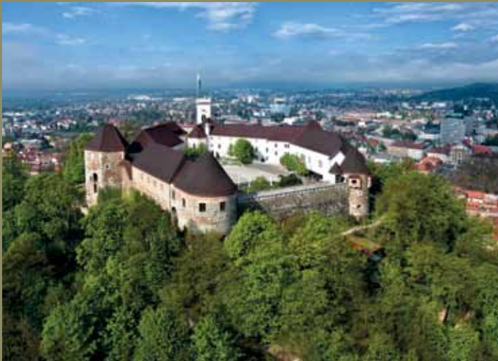
Ljubljanski grad/Ljubljana Castle.

Publikacija je brezplačna./Publication is free of charge.