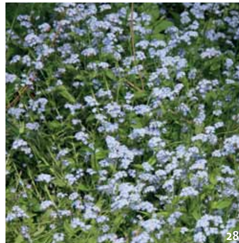
29.) Velecvetna zvezdica/Addersmeat ( Stellaria holostea ).