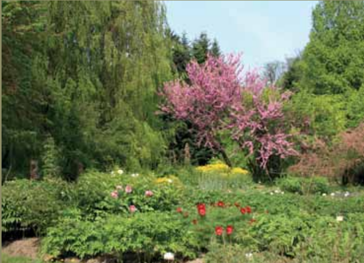
Botanični vrt Univerze v Ljubljani/University Botanic Gardens Ljubljana.