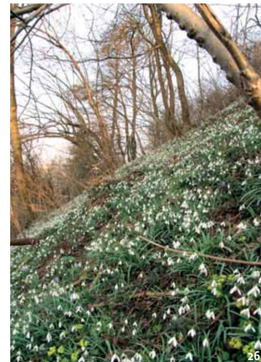
26.) Navadni mali zvončki ( Galanthus nivalis ) so na Grajskem hribu množično prisotni. Najprej zacvetijo povsem blizu poti na južni strani gradu, marca pa jih je največ na severni strani./Common snowdrops ( Galanthus nivalis ) are abundant on the Castle Hill. They first bloom very near the path on the southern side of the castle, and in March they are mainly on the northern side.