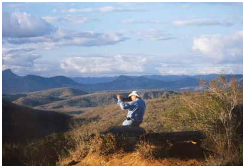
Sol zemlje/The Salt of the Earth