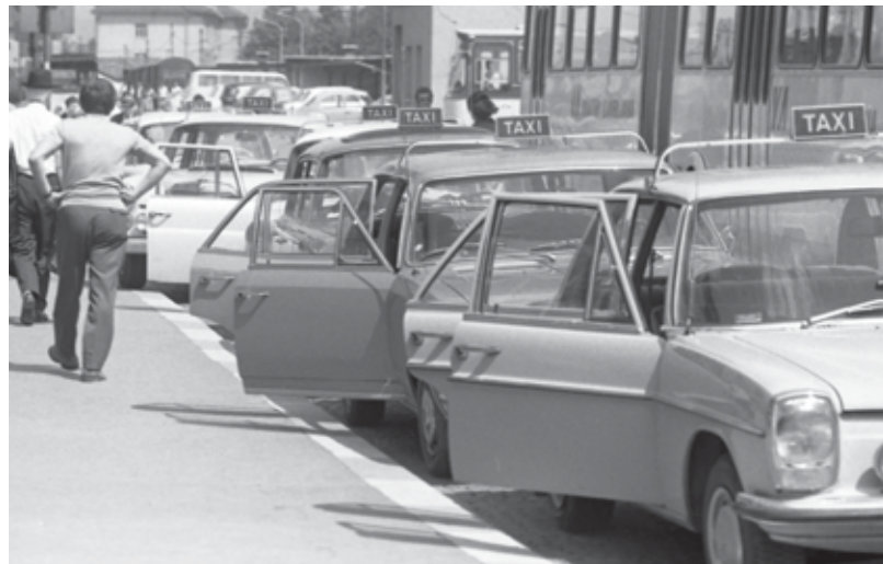
Taksisti v Ljubljani. Ljubljana, julij 1974. Taxi drivers in Ljubljana. Ljubljana, July 1974.

The first of four exhibitions that we are preparing this year within the framework of the title Ljubljana European Green Capital will be the photography exhibition Through Ljubljana Streets - Traffic in Ljubljana in the 20 th Century . Forty photographic images by numerous well-known Slovenian photojournalists will reveal to visitors the image of the capital right back to the days when only trams and carriages filled the city streets of Ljubljana. In the 20th century, Ljubljana was transformed from a city of horses and carts to an urban capital.