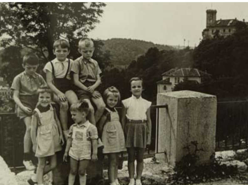
Na Gradu leta 1955, / Ljubljana Castle, 1955